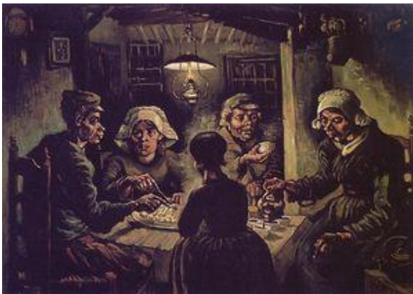
The Potato Eaters